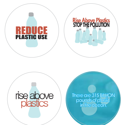
Set of 4 Pins